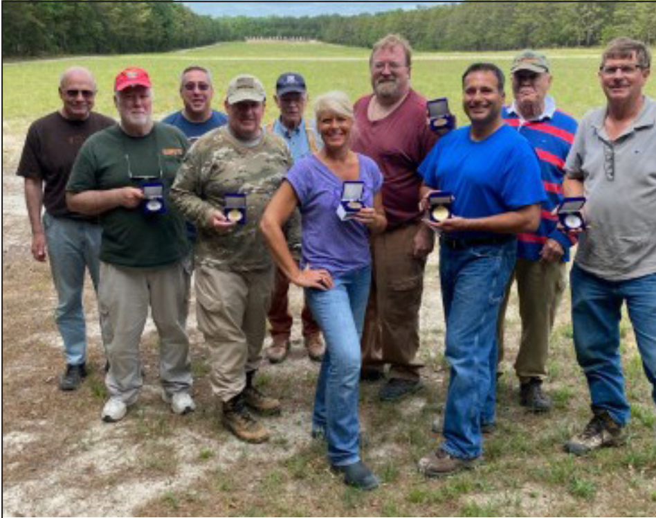
The participants and their awards at the Black Powder Eastern Regional and New Jersey State Championship Match on June 12.