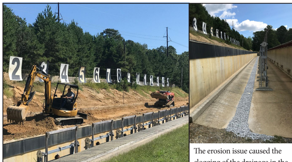
Erosion repair on the berm was accomplished this year on the 600 yard range.

The erosion issue caused the clogging of the drainage in the target pits on the big range. All fixed now!