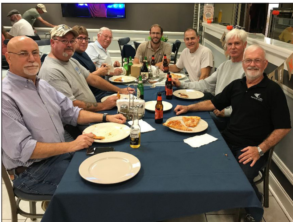
The High Power League tore the center out of the targeted pizzas at the end-of-year pizza party.

ALSO, NO GUESTS ARE PERMITTED TO USE THE PRACTICAL RANGE.