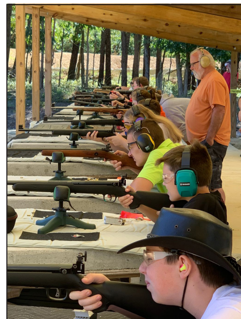
These Juniors sure do concentrate!!