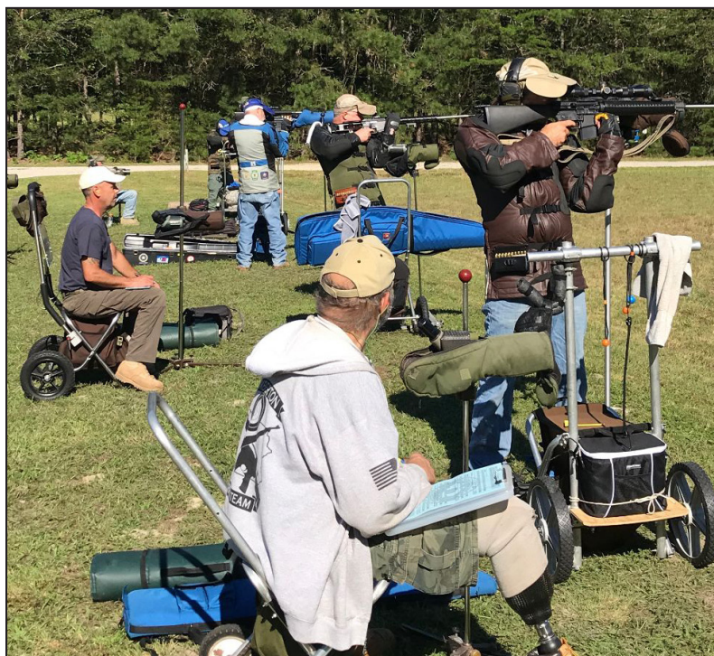
The offhand portion of a Service Rifle Match. This is not where you find out if your rifle can shoot. You find out if YOU can shoot!

The re-election of Phil Murphy means more challenges ahead for legal gun owners in NJ. The United States Supreme Court heard oral arguments on November 3rd, surrounding a case that will have national ramifications no matter what the majority rules. The case that was argued challenges the "May Issue" standard in New York City. If the decision rules that this very restrictive law is unconstitutional,