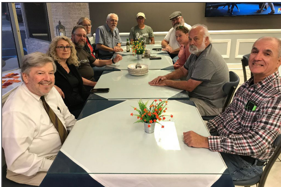
The Pistol League found the target with a rapid fire steady hand and pizza ! No slow fire here.